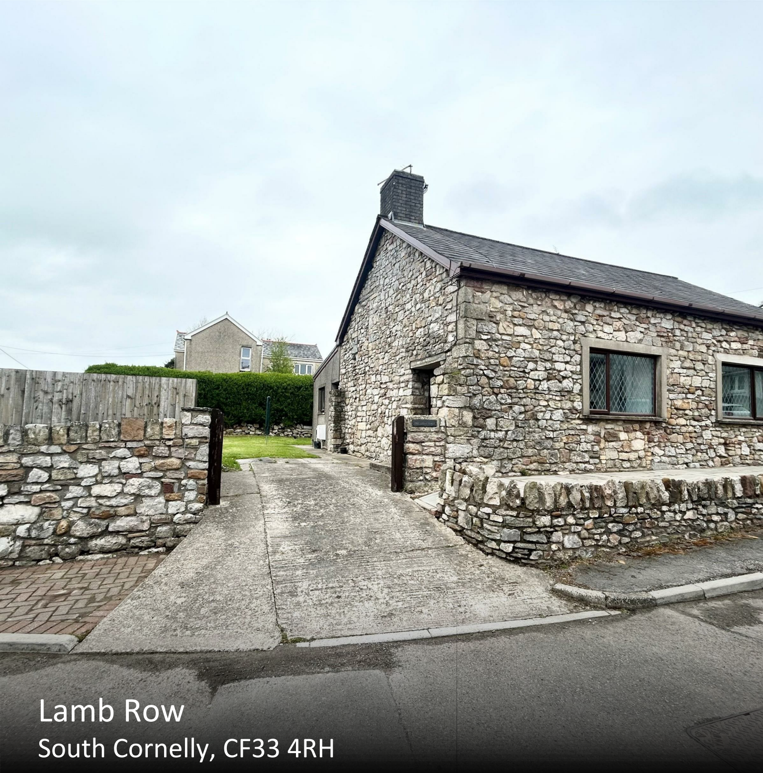
Lamb Row South Cornelly, CF33 4RH